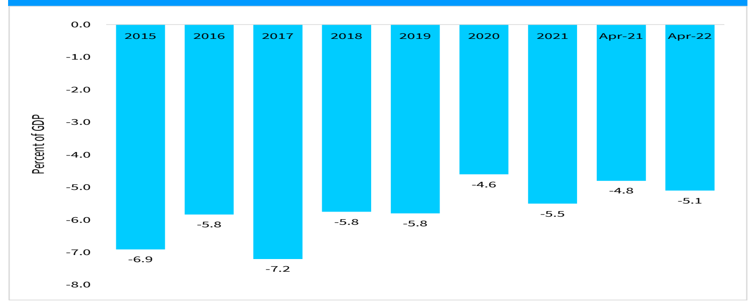
Chart 1: Current Account