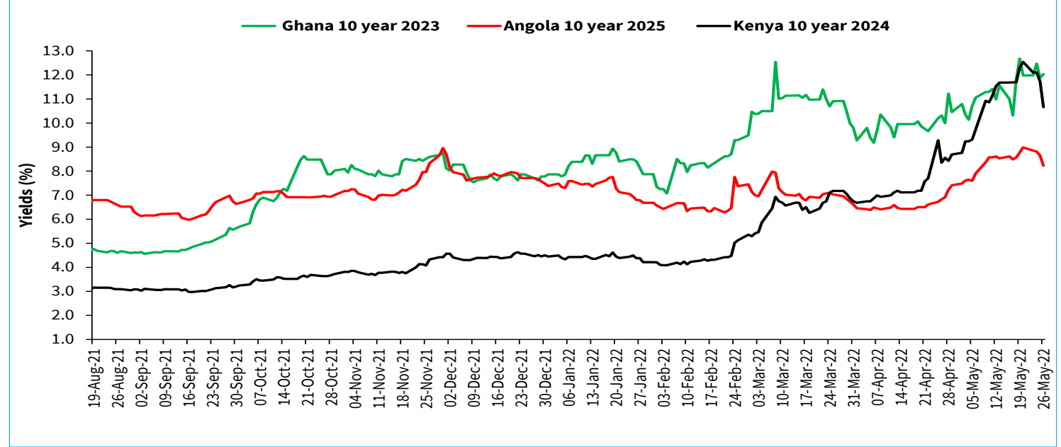
Chart 3: Yields on 10 year Eurobonds for Selected Countries